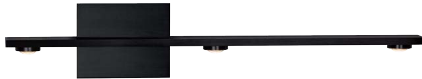
BI #%%#%267E 44