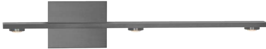
BI #%%#%2673 >