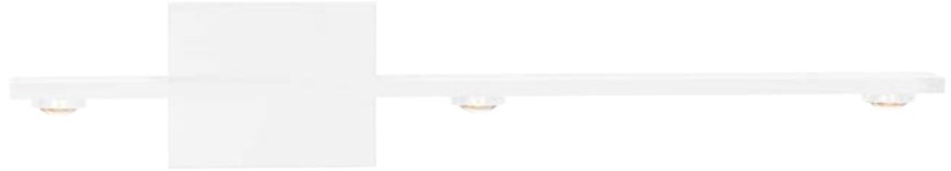
BI #%%#%267Z :